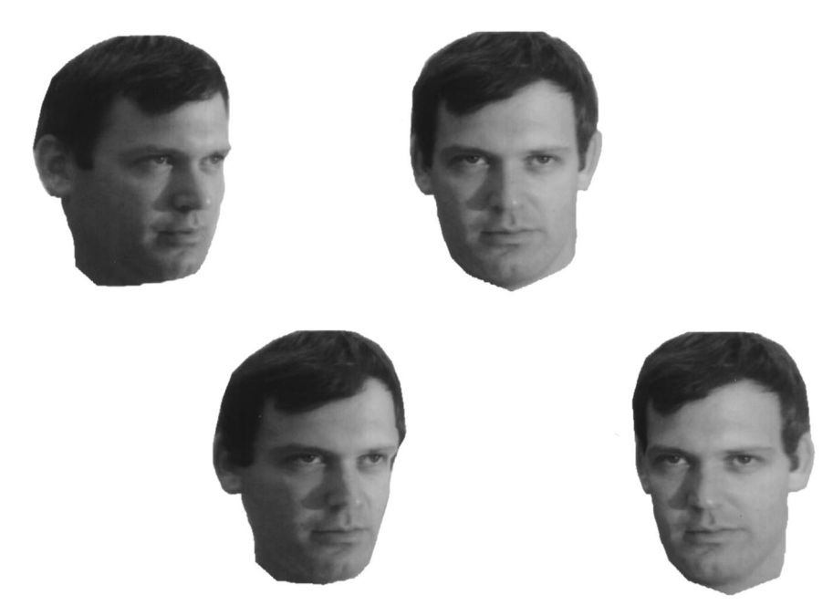
Fig. 2. A view-combination of gray level face images. On the top row are the two basic images. Bottom row: two view combinations, depicting the same person from new viewing directions. Left: an interpolated view. Right: an extrapolated view, beyond the range spanned by the original views.

formation was indeed rigid (Ullman and Basri, 1991). It is natural to consider also a more general case, in which objects are allowed to undergo more general distortions, for example, some stretch along one dimension. For general linear transformations of the object, it turns out that it becomes possible to use just two views of the object. (This observation was also made independently by T. Poggio.) Unlike the three-views formulation, this two-views formulation uses a mixture of x and y coordinates. This combination is somewhat less intuitive than the combination of three views, but the use of only two rather than three views is sometimes more convenient.